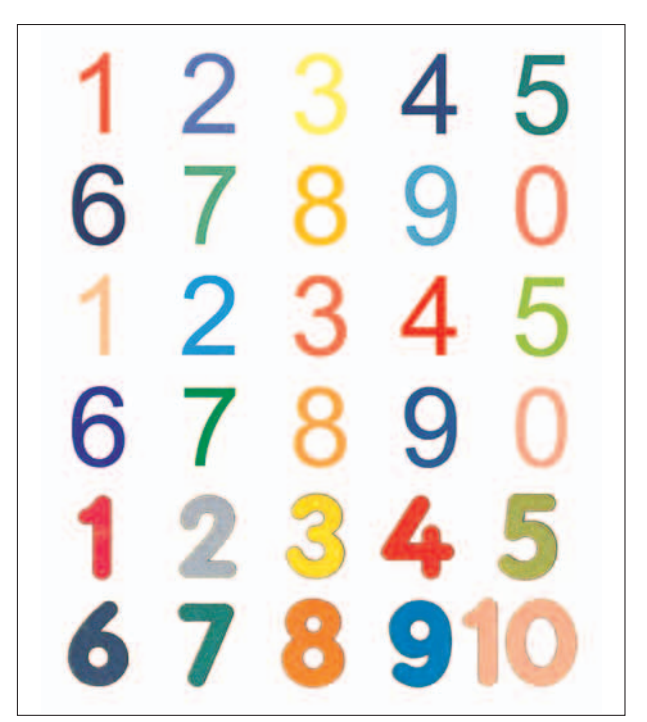
Fig. 1 – The congruent colours chosen by R (top) and T (middle), with a reproduction of the colours used in the jigsaw (bottom).

Of the 480 trials, 49 (10.2%) were removed for R and 51 (11.25%) for T because the voice trigger either failed to detect the word, or was observed to be triggered by some extraneous noise such as a tongue click. A further 38 (R) and 19 (T) were removed because of being more than two standard deviations from the mean<sup>1</sup>. Mean reaction times for answers to congruent and incongruently coloured